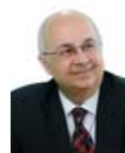
Ismail Serageldin, Ph.D. Bibliotheca Alexandrina, Alexandria, Egypt